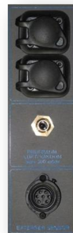
Kit connection panel