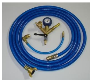
filler fitting with safety valve