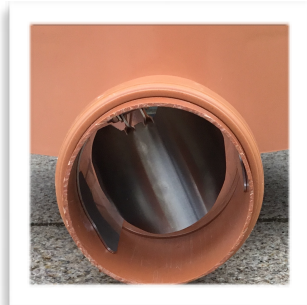
Not like this.

Ensure the Ratflap is perpendicular in the pipe.