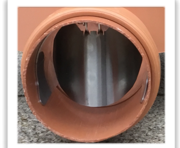
But like this.

If your sewer chamber is deeper than arms length you will hopefully have ordered the Ratflap with the install tool and the install pole. You will still need to secure the lanyard first and then attach the Insert tool to the threaded end of the pole, lower the Ratflap into the chamber, wriggle the unit into position in the pipe, when you are happy with its positioning undo the pole and take it out, again making sure the Ratflap is perpendicular in the pipe, the vertical position of the pole will tell you this.